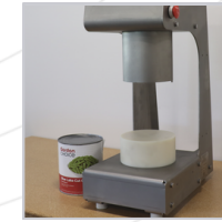
Adjustable Height Block